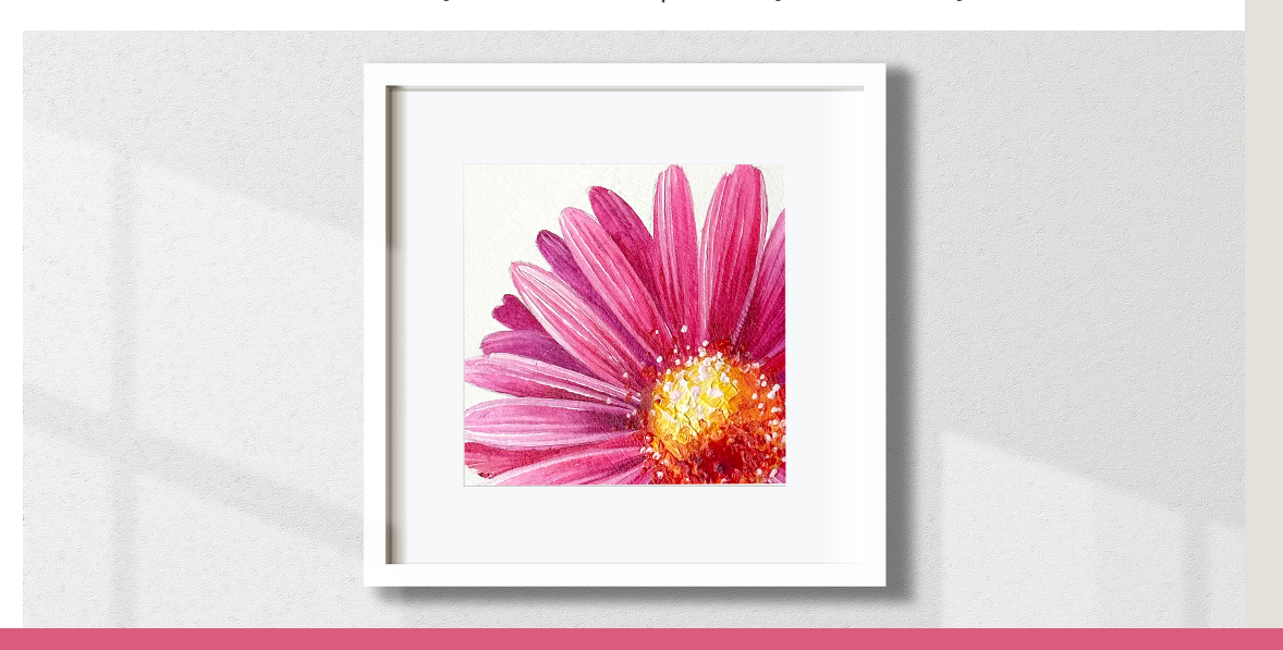
FOR MORE TIPS AND TUTORIALS VISIT WILLOWWOLFE.COM